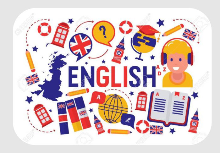
In English from 13:30h to 15:30h (CET-1)