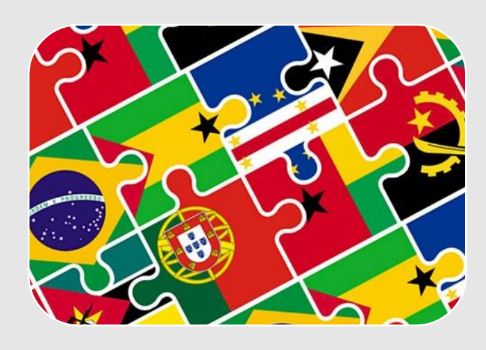
In portuguese from 16:00h to 18:00h(CET-1)