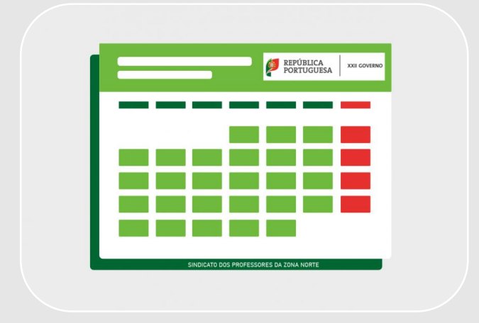
From 13th to 17th september